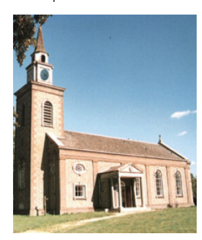
The Friends of Bawdeswell Church welcome you.