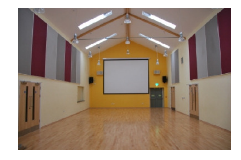
Parish Magazine https://thereevestale.co.uk